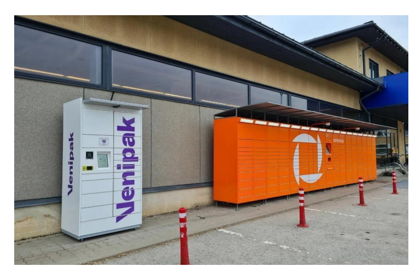
Source: Daily newspaper Postimees. New Option for Parcel Pickup. <u>https://jarvateataja.postimees.ee/7755536/lisandus-veel-uks-postipaki-kattesaamise-voimalus</u>